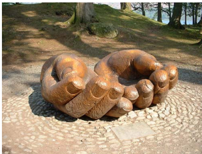
Sculpture in Brandlehow Woods

Now follow the lakeshore path through the wooded shore line, passing High Brandlehow Landing stage and then Low Brandlehow, eventually returning to the start point at Hawse End.