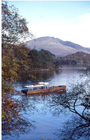
Launching stage at Hawse End

This walk starts at Hawes End which can be best reached by taking the Launch from Keswick to Hawes End landing stage or alternatively by car (limited parking) and by bus. If you arrive by launch follow the path up to the road away from the lake shore.