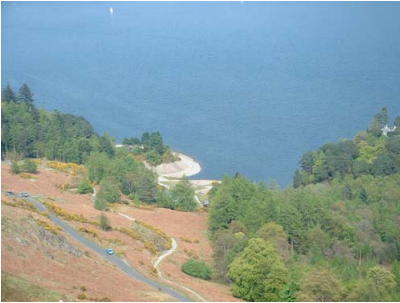
Looking towards Brandlehow Bay from Hawse Gate

From Hawes Gate descend the steep but made up path left (East). Pass the short cut with sign “No Path” and continue down. Take the path left towards a plantation of conifers. Here you join the main terrace path but your direction is down following a dry stone wall to the road. Follow the road left for approx 50 metres and turn right down to the lakeshore at Brandlehow Bay past the old mine workings.