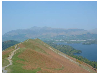
From Catbells looking back to Keswick

After the required stop, the photos, the pat on the back and general enjoyment of the views, descend south to the saddle of Hawes Gate